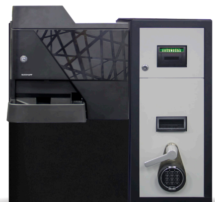
SPS-300 Paired with the CRS-600

The SPS-300 fully automates your note handling at the point of sale, speeding up the process and allowing you to spend less time managing your cash. When paired with the CRS-600, this solution can completely replace your till, allowing the SPS to handle your cash, which reduces human reporting errors and increases staff safety.